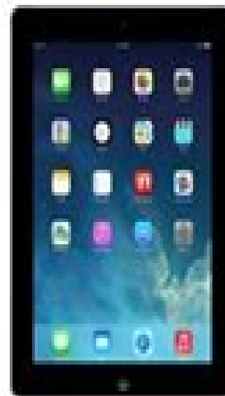
iPad with Retina display