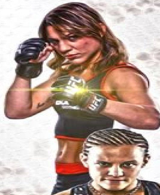
Bethe "Pitbull" Correia