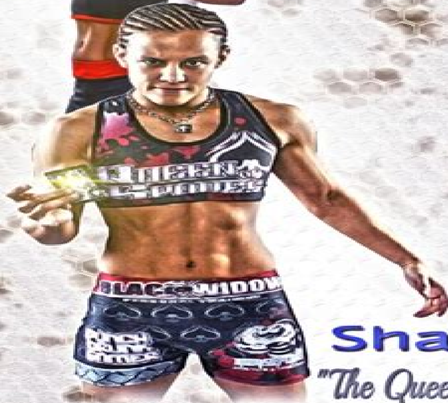
Shayna "The Queen of Spades" Baszler