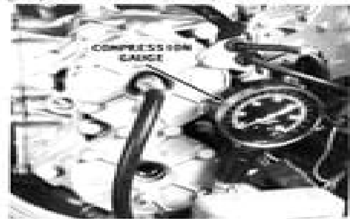
A compression check should be taken in each cylinder before spending time and money on tune-up work. Without adequate compression, efforts in other areas to regain engine performance will be wasted.

Remove the spark plug wires. ALWAYS grasp the molded can and pull it loose with a