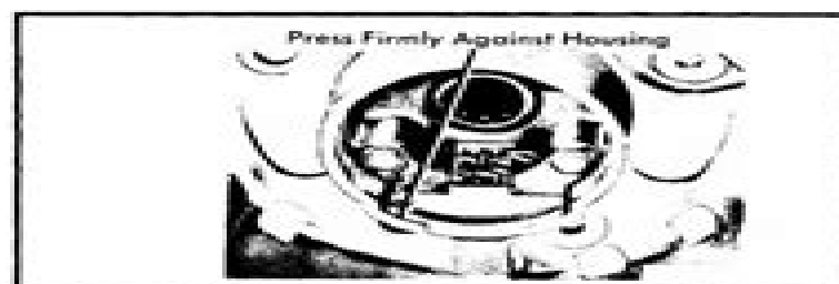
Fig. 7 View Showing Proper Positioning of Brush Leads

NOTE — Dished washers are to be used only on circuit board with exposed diodes. If dished washers are used on single circuit board, short circuit will occur.