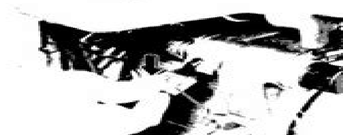
1. Tilt lever