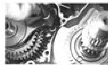
8. Install the upper drive shaft.