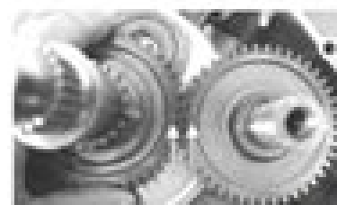
6. Keeping the dirt shielded as shown, install the shaft into the lower and upper shaft ends.