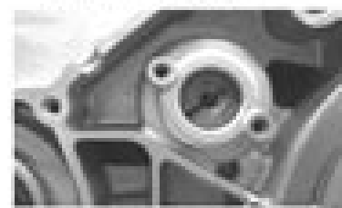
7. Align the lower shaft fork with the gear cluster and install the lower shaft fork. While holding the gear cluster in place, install the lower shaft fork, and snap ring.