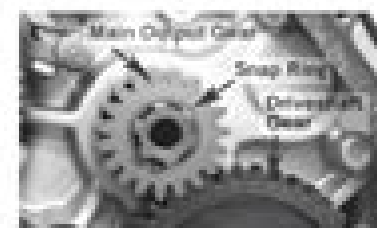
5. Install the lower shaft fork and the shaft fork shaft.