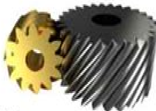
screw gears (hyperboloid gears)