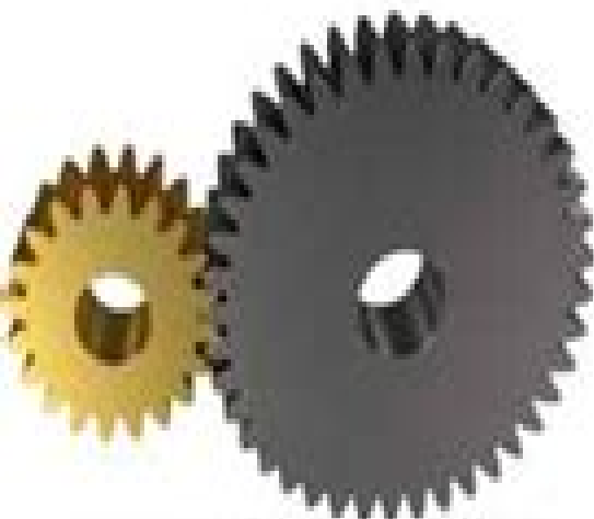
spur gears (external toothing)