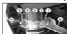
A. Spring Preload Adjuster B. Shock

Turn the adjuster counterclockwise to increase spring preload and stiffen the suspension. Turn the adjuster clockwise to decrease preload and soften the suspension.