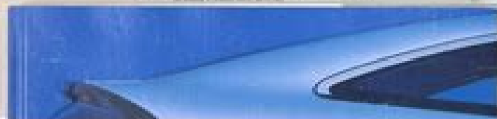
C-Class Sports Coupe Operator's Manual