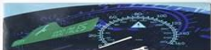
Service Booklet Passenger Cars