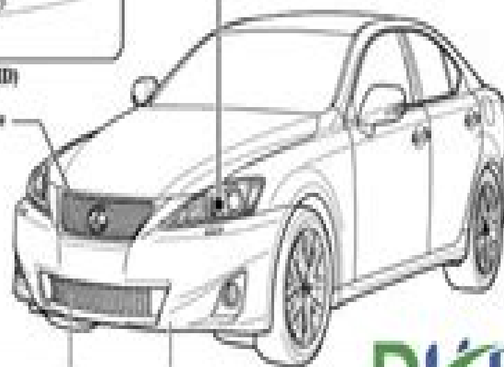
Radiator Upper Grille