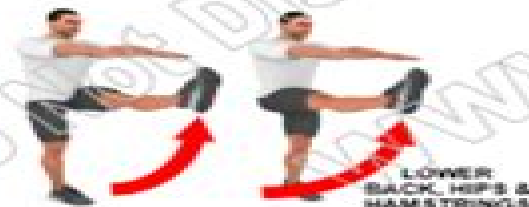
LOWER BACK, HIPs & HAMSTRINGS