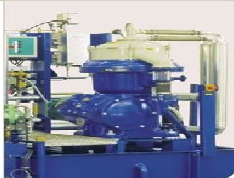
Fig. 1. MOPX separator system.