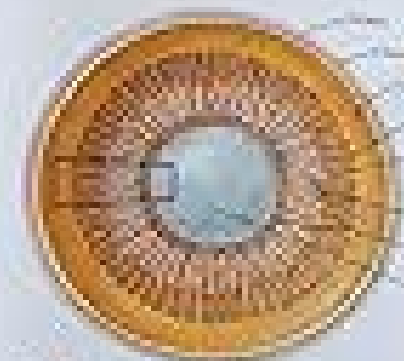
Diagram illustrating the structure of the eye wall and supporting structures.