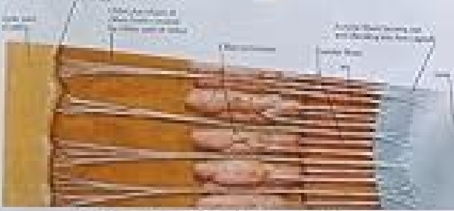
Diagram illustrating the structure of the eye wall and supporting structures.