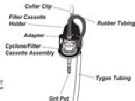
Figure 3 Cyclone with filter cassette in holder