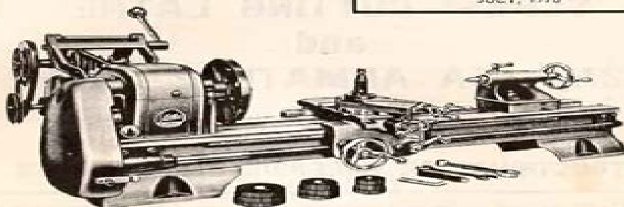
NO. 618 BENCH LATHE