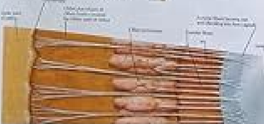
Diagram illustrating the structure of the eye wall and supporting structures.