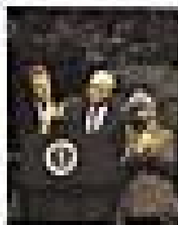
President Barack Obama and Vice President Joe Biden at a public event.

What are the powers of the President? The President has the power to sign laws, veto laws, and appoint and remove federal judges. The President also has the power to declare war and to negotiate treaties. The President is also the commander in chief of the armed forces. The President is elected for a four-year term and can be re-elected for one more term.