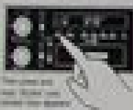
Seek and Scan buttons used when scanning