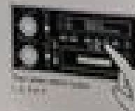
Set (SET) button