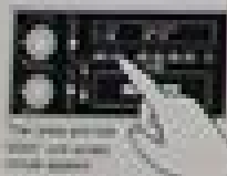
Seek and Scan buttons used when scanning