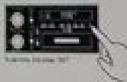
Automatic Frequency Scan