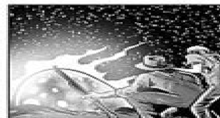
From Up Above