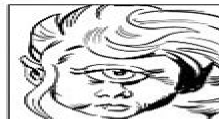
I Am A Cyclops