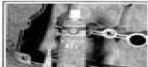
Fig. 7 On some engines, RTV is used instead of gasket material to seal components.

add to each metal surface of a terminal with something that won't conduct electricity, but have it if you don't know it works. When the connection is tightened the metal-to-metal contact between the terminals will displace the grease (allowing the circuit to be completed). The grease that is displaced will then coat the non-contacted surface and the cavity around the terminals, sealing them from phosphoric moisture that could cause corrosion.