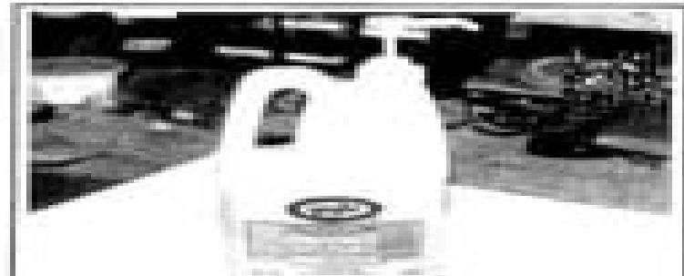
Fig. 8 That new ultra hand cleaners not only work well, but they smell pretty good too. Choose one with pump for added cleaning power.

There are two types of cleaners on the market today: parts cleaners and hand cleaners. The parts cleaners are for the parts; the hand cleaners are for you. They are not interchangeable.