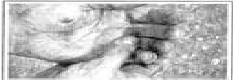
Fig. 9 The use of hand lotion keeps your hands and keeps dirt and grease from sticking to your skin.