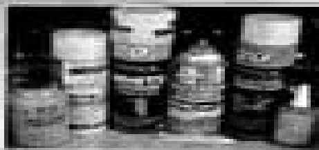
Fig. 5 Antifreeze, penetrating oil, lithium grease, electronic cleaner and chrome spray. These products have hundreds of uses and should be a part of your ultimate tool collection.