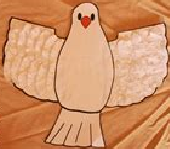
Crafting The Word Of God