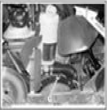
1. Connect fuel tank pipe to engine.

Unplug from the coolant reservoir the hose going to the engine.