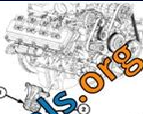
Fig. 14: Engine Mount & Fasteners