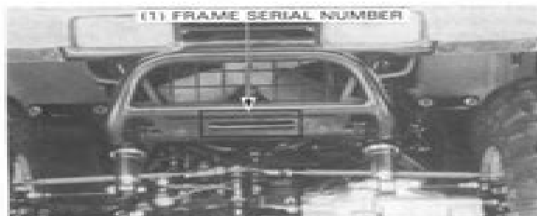
(1) FRAME SERIAL NUMBER

(3) The frame serial number is stamped on the front bumper.