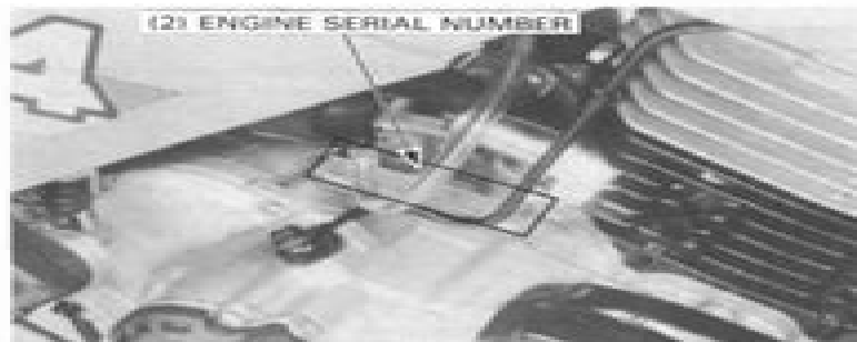
(2) ENGINE SERIAL NUMBER

(3) The frame serial number is stamped on the front bumper.