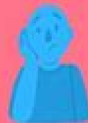
Lack of initiative