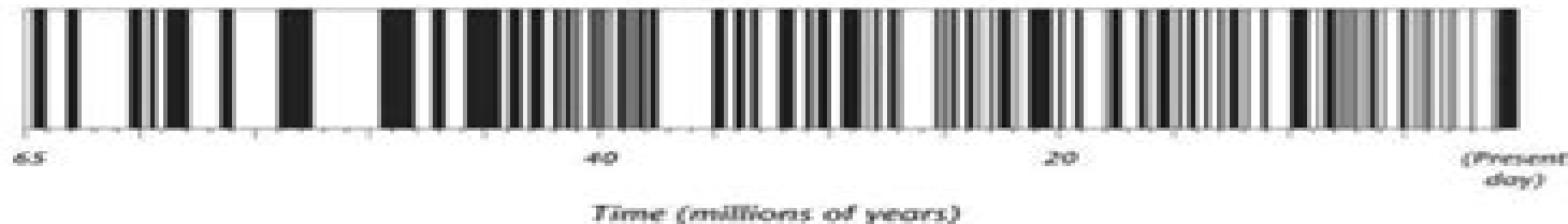
Reversals in Earth's Magnetic Field

In this graph, each dark band represents a "normal" magnetic field, as it is today. Each light band represents a reversed magnetic field.