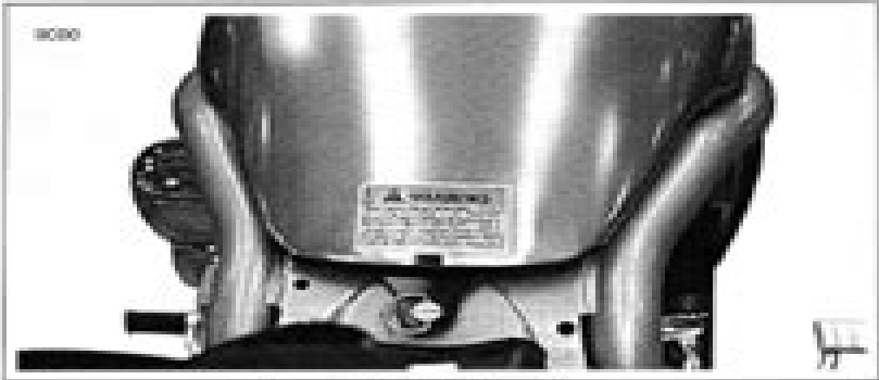
Figure 1-1. Airbox Cover