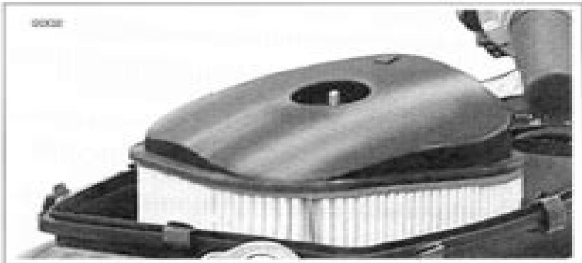
Figure 1-3. Air Filter