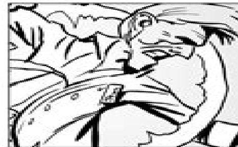
A Stand-Up Guy