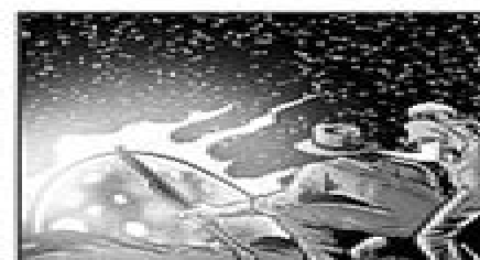
From Up Above