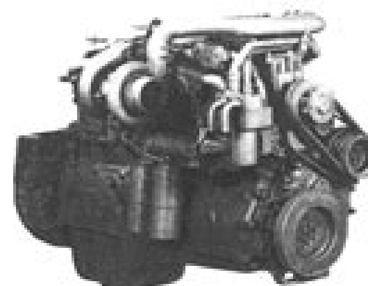
Big Cam IV