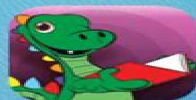
Starfall I'm Re...