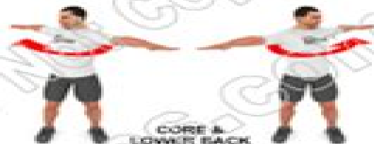
CORE & LOWER BACK