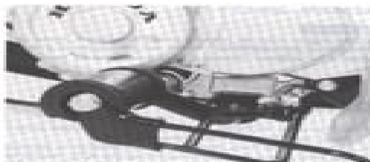
The engine serial number is stamped on the cylinder lower left side.