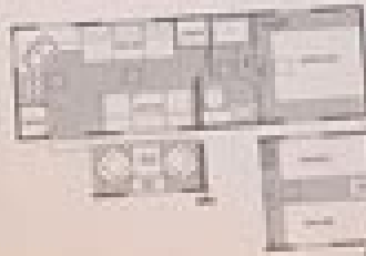
Model 23 50