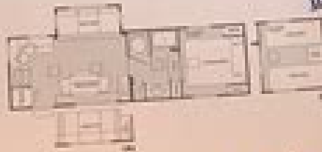
Model 24 57