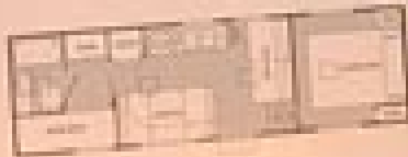
New Model 25 50