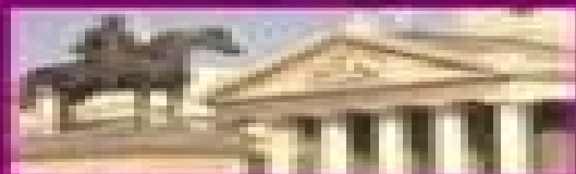
Walks & Tours