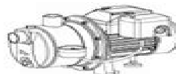
SS Series 62013/62023