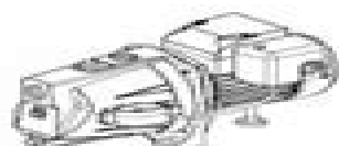
Cast Iron Series 60013/60023/60033