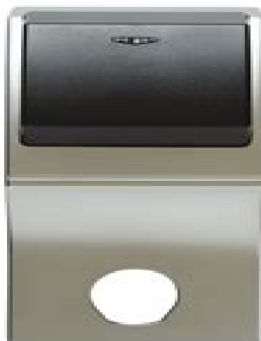
HT RFID Upgrade Kit