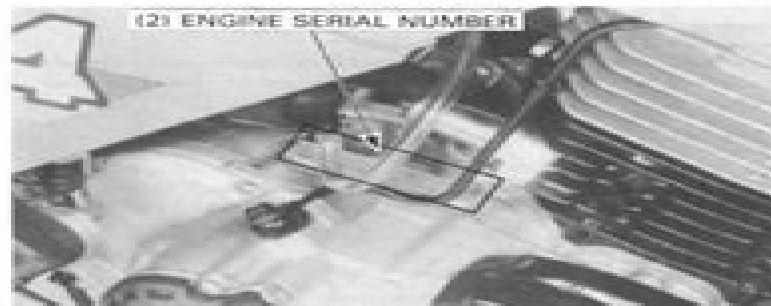
(2) ENGINE SERIAL NUMBER

(3) The frame serial number is stamped on the front bumper.