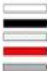
Small white plug x13598