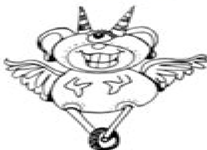
5. Agnes stover