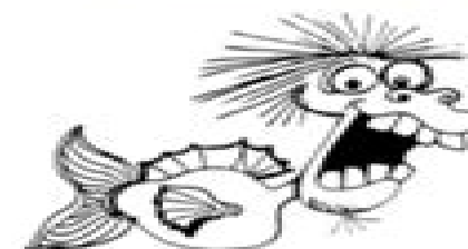
7. Elton ashmun