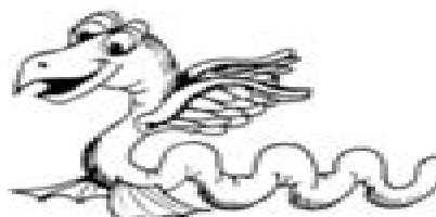
6. Nora outfleet