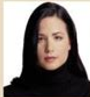
No widow's peak