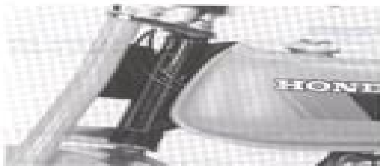
The frame serial number is stamped on the closing head left side.