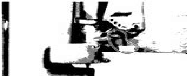
1. Normal position

This system allows cruising in shallows by inclining the outboard motor 20 degrees, although previously this was not possible.