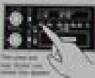
Seek and Scan Manual Scan