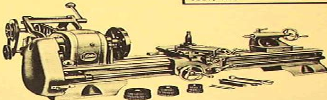
NO. 618 BENCH LATHE