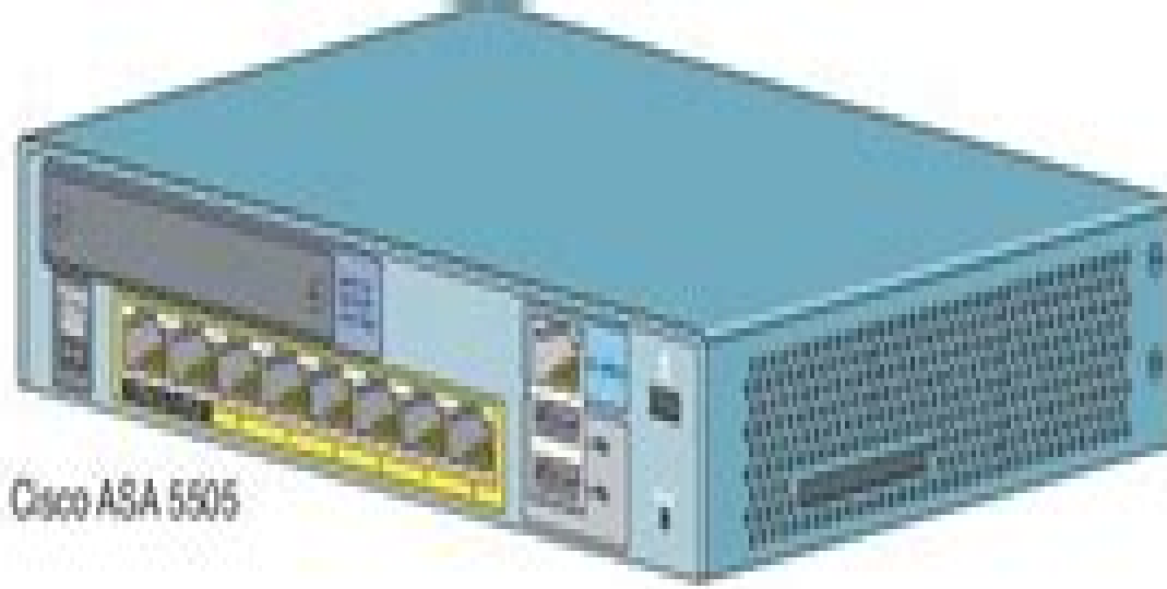
Cisco ASA 5505