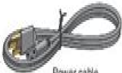
Power cable (US shown)