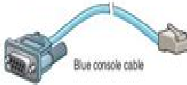
Blue console cable