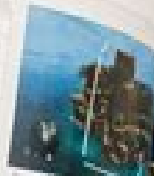
The Blackbeard's Shipwreck is a large, ancient shipwreck that is the most famous of the many shipwrecks scattered across the island.