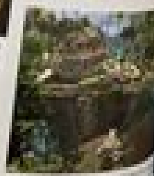
The Blackbeard's Shipwreck is a large, ancient shipwreck that is the most famous of the many shipwrecks scattered across the island.