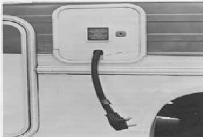
115 VOLT POWER CORD

If a battery charger is installed with the converter, auxiliary batteries will be brought up to full charge and maintained by the battery charger as long as 115-volt power is available. Maximum battery charge rate is up to 10 amps depending upon model. See Owner's Information Kit for operation and maintenance instructions.