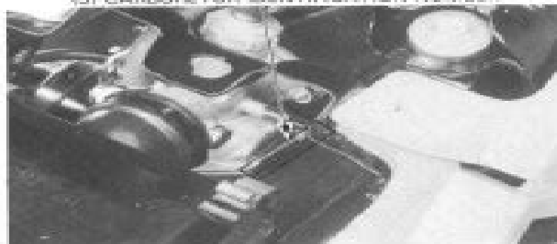
(3) CARBURETOR IDENTIFICATION NUMBER

The carburetor identification number is stamped on the