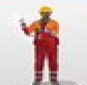
Use Whip Line