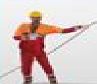
Extend Boom 2