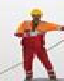
Retract Boom 2