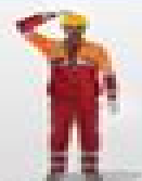
Use Main Hoist